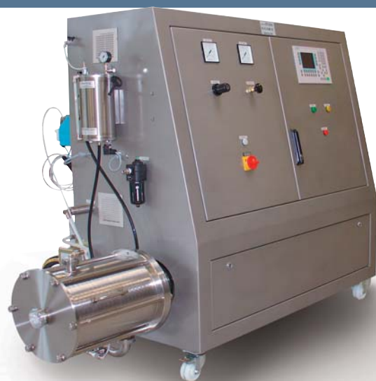
SICOMIX for non-woven and textile industry